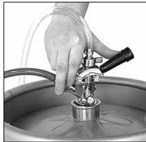
Turn the handle clockwise a \frac{1}{4} turn.