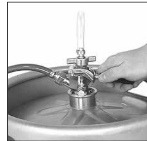
Pull the handle out and push it down to the locked position, which activates the pressure and beer lines. You are now ready to draw beer.

NOTE: When removing a keg tap, first turn off the secondary regulator to the tap, located by following the red air line from the keg tap to the secondary regulator shut-off valve. Pictured to the right is a sample two product secondary regulator with shut-off valves in the closed or off position.