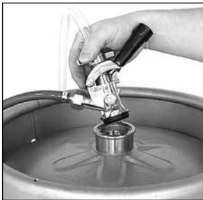
Position the tap head in the barrel neck.

Glastender normally provides a lever-type keg tap for each keg in the beer system. Please refer to the following instructions when placing a keg tap on the barrel.